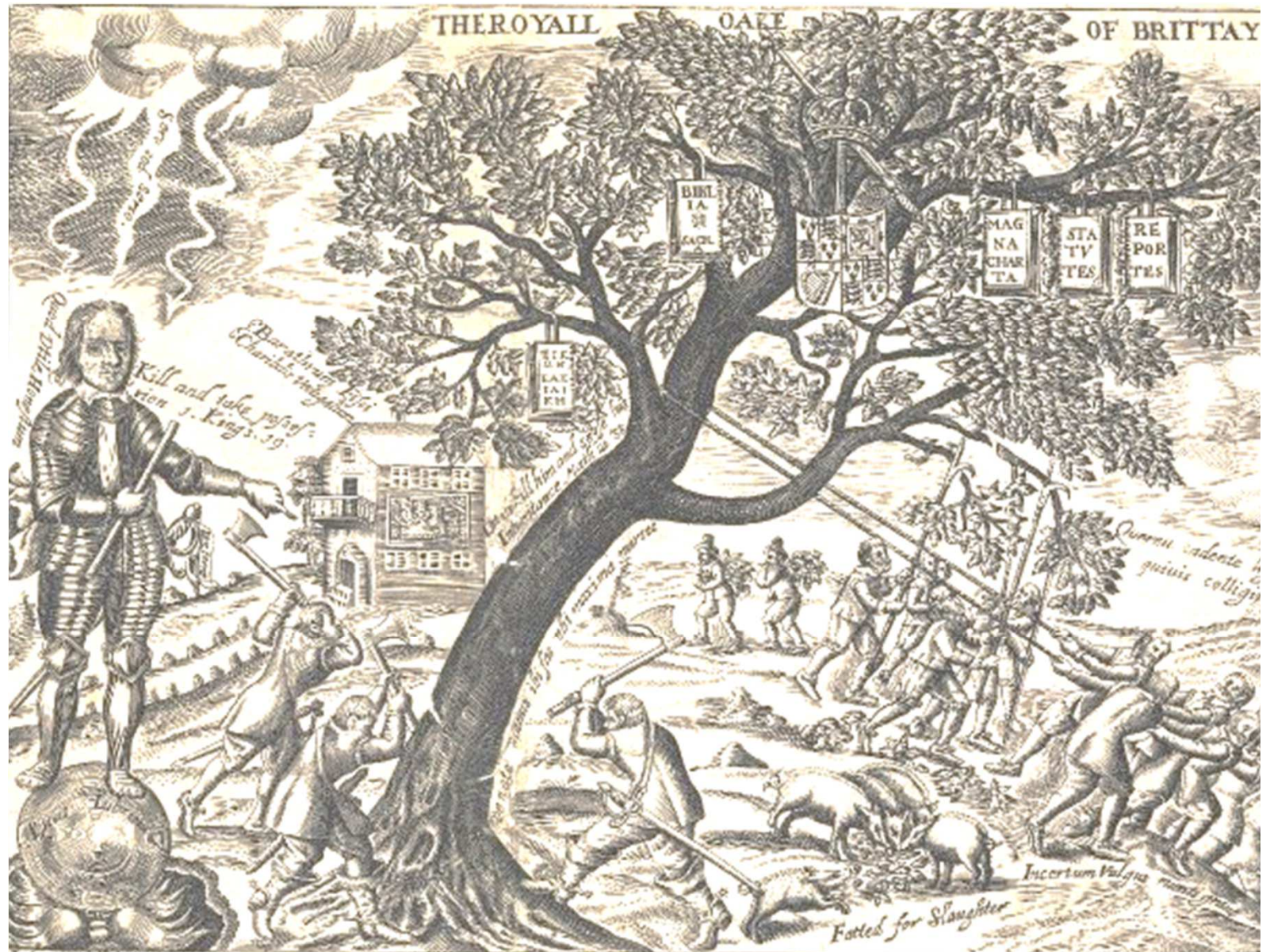
The Royal Oak of Britain 1649