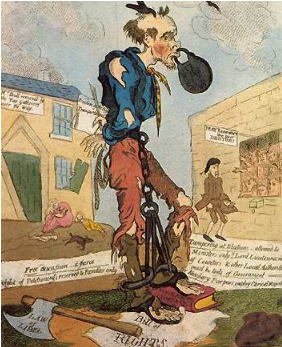
A Free Born Englishman! The Admiration of the World and The Envy of Surrounding Nations 1819