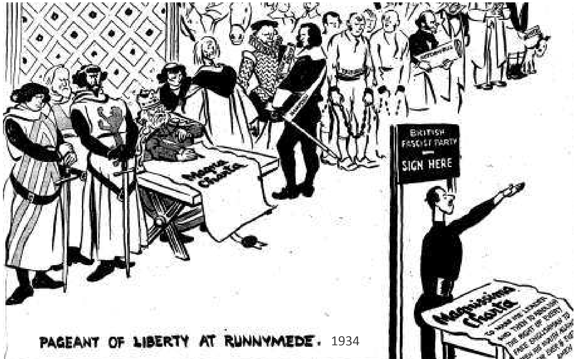
PAGEANT OF LIBERTY AT RUNNYMEDE. 1934