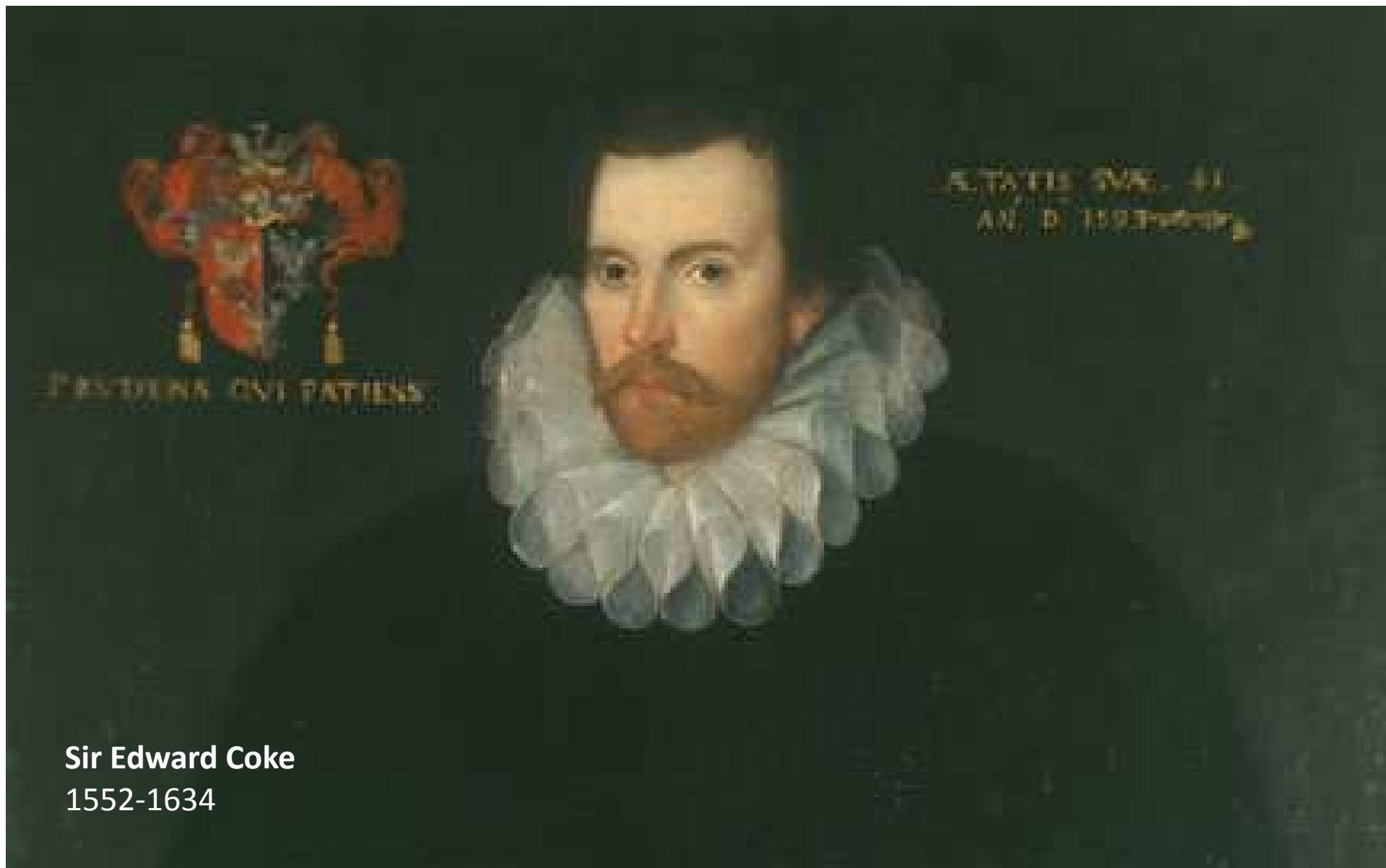
Sir Edward Coke 1552-1634