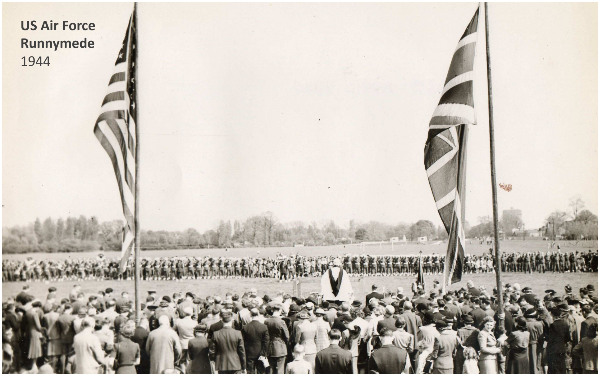
US Air Force Runnymede 1944