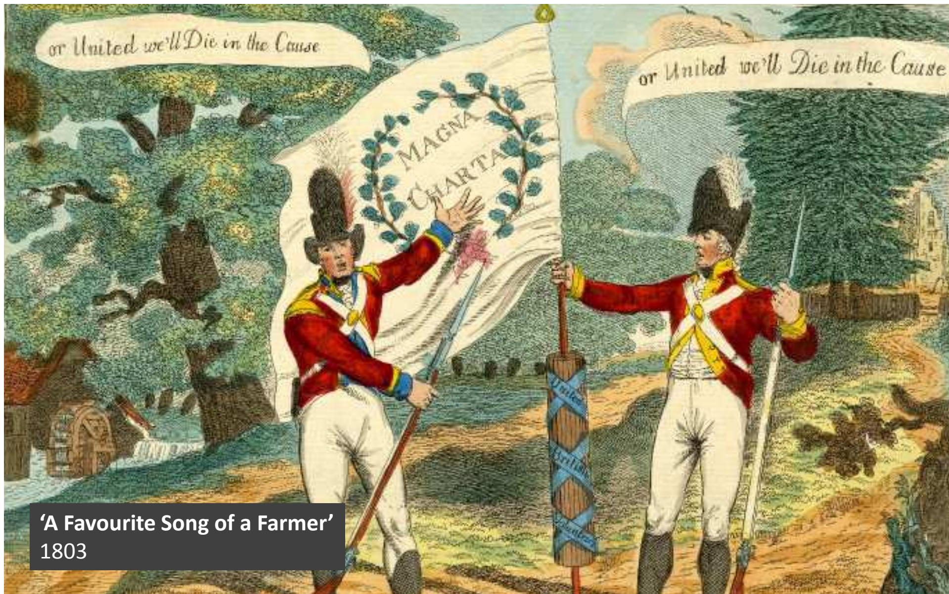
'A Favourite Song of a Farmer' 1803